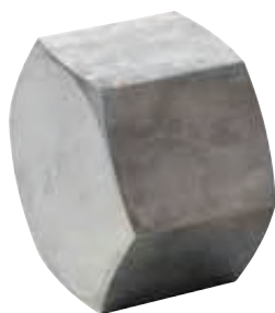
NPT Threaded - Hexagon cap