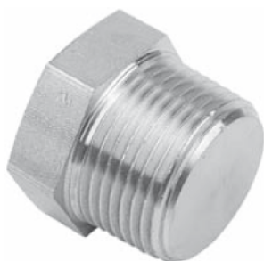
NPT Threaded - Hexagon head plug