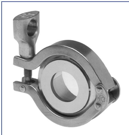
Metal fused Triclamp sanitary sightglass fitting

Metal fused sightglass for Triclamp fittings