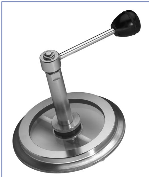
Sightglass for Triclamp fitting with built-in wiper, series WD

Metal fused sightglass with with wiper series WD