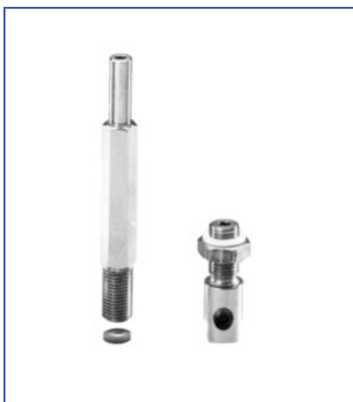
Spraying unit of the series SVS

Spraying units for circular sightglasses to DIN 28120 or similar