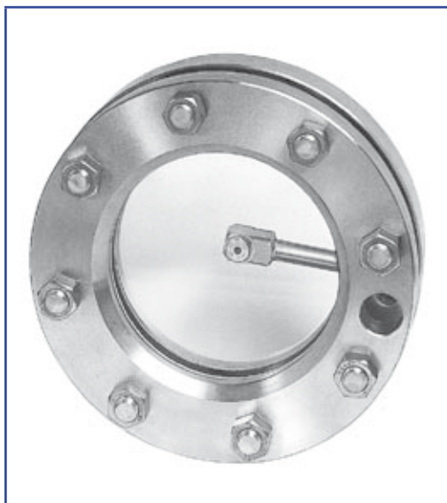
Spraying unit, type SV 4, built into circular sightglass similar to DIN 28120, DN 125, PN 6.

Spraying units for circular sight-glasses to DIN 28120 or similar.