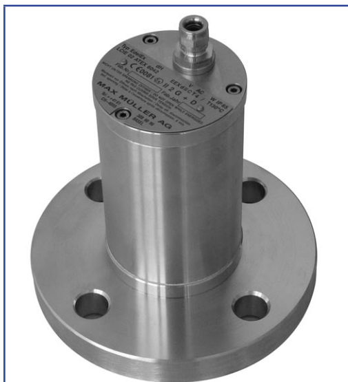
Sightglass light fitting type EdelEx STERI-LINE 20 dH, 24 V, 20 W, EEx d IIC T4, Ex II 2 G + D, on metal fused sightglass flange

Sightglass light fittings from st. steel for use in hazardous areas